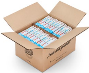
Loose sachets in carton. Make-up may differ from illustration.

Bulk product cartons of 250 individual sachets each / loose (≙ 250 litres mixed drink)