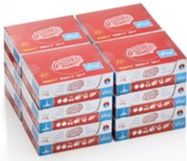
In handy boxes for easy presentation and practical distribution.

Cartons of 12 boxes of 20 sachets each (≙ 12 x 20 litres ≙ 240 litres of mixed drink)